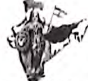
भारत माता जी जय