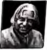
Dr. A.P.J. अब्दुल कलाम