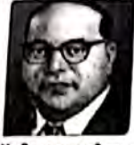
डॉ. भीम राव अम्बेडकर