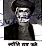
ज्योति राव फुले