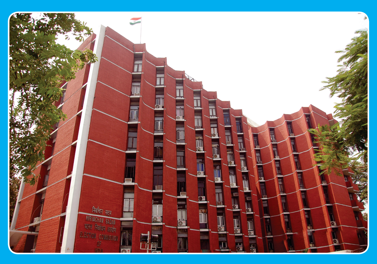
"No voter to be left behind"